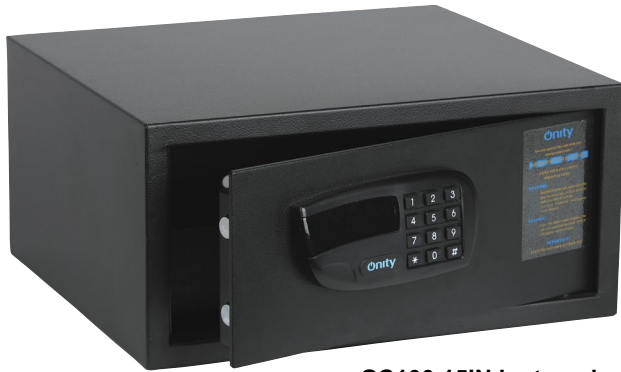
OS100 15IN laptop size