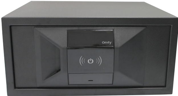
OS700 standard laptop size

The Onity OS700 RFID guestroom safe is designed to efficiently utilize space and securely store laptops, tablets, purses or other valuables. It comes in traditional front opening drawer (right or left hand options), is available in black and may be keyed alike. All models are fully motorized with two solid steel, anti-drill rotating bolts and feature low battery warning, audit trail and mechanical key override.