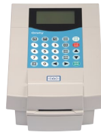
HT22 encoder: receive RMA credit

Limited time offer – order your upgrade by June 30, 2021 and install by November 30, 2021