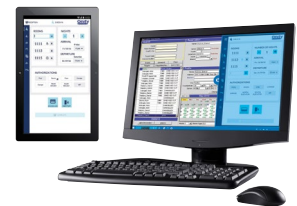
Upgrade to Onity's latest front desk system today